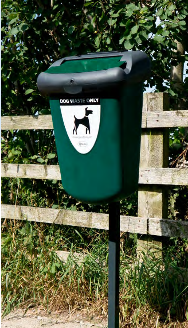
Retriever 35™ Dog Waste Bin

To help keep pavements and open spaces clear of dog fouling, we produce a range of dog waste bins that are extremely strong and durable. Designed to be wall- or post-mounted, these dog waste bins will encourage owners to tidy up after their dogs, keeping areas clean and tidy.