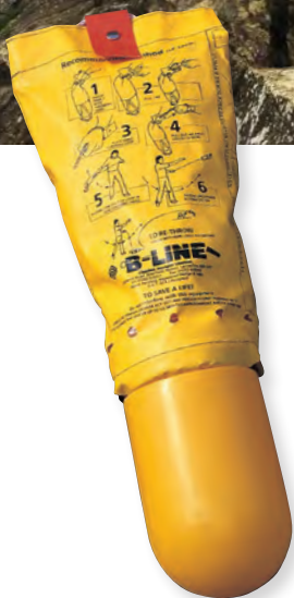
B-Line™ Water Rescue Device