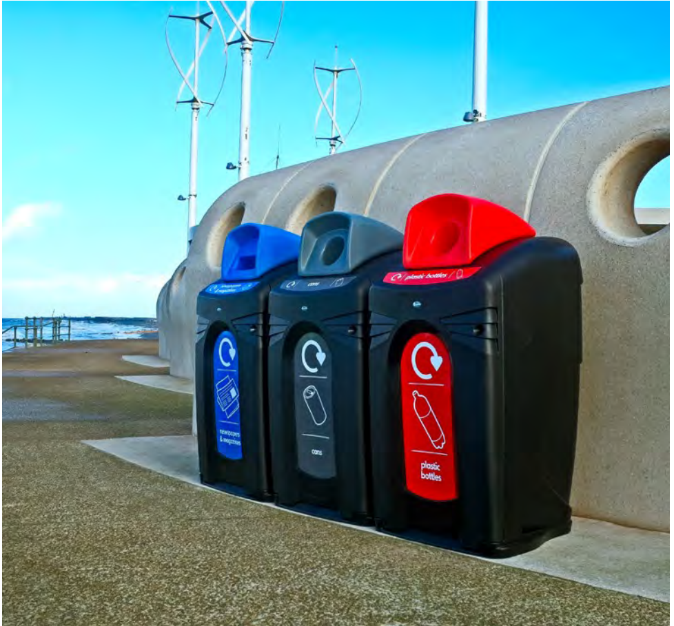
Nexus® City 240 Recycling Bin