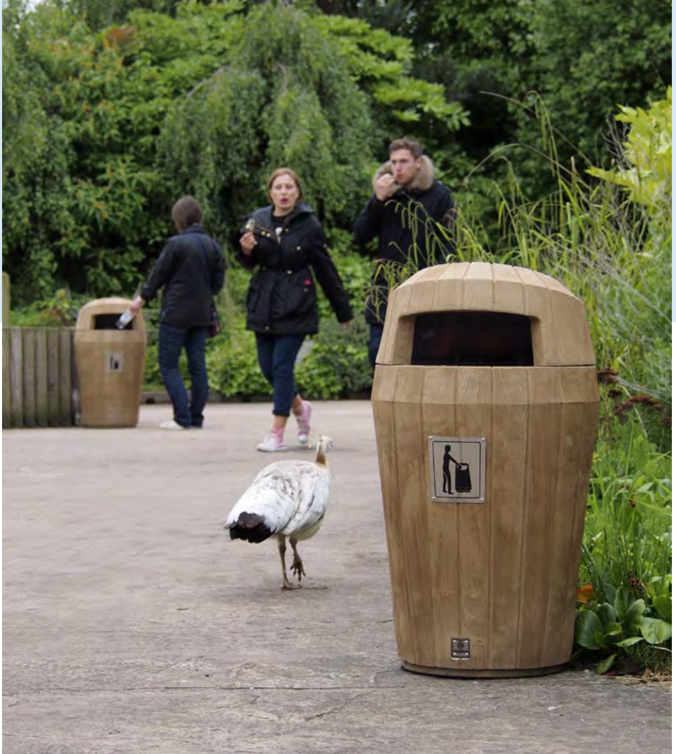
Sherwood™ Litter Bin

We recognise that waste management requirements may completely differ from one organisation or setting to another. That's why we supply a variety of litter bins that will suit all styles, budgets and requirements. All of our litter bins are easy to clean and never need painting, giving you an attractive and highly functional waste container for many years.