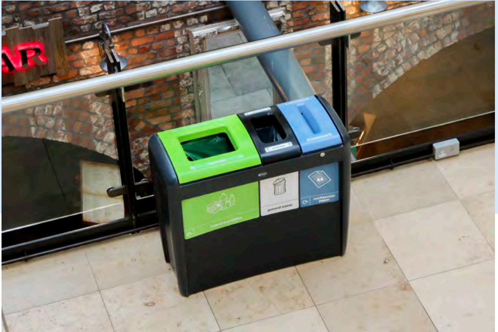
Nexus® Evolution Trio Recycling Bin

Apertures and graphics are available for various waste streams, allowing you to manage recycling waste more effectively.