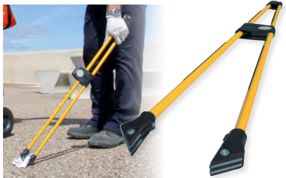
Litta-Pikka™ Collection Tool