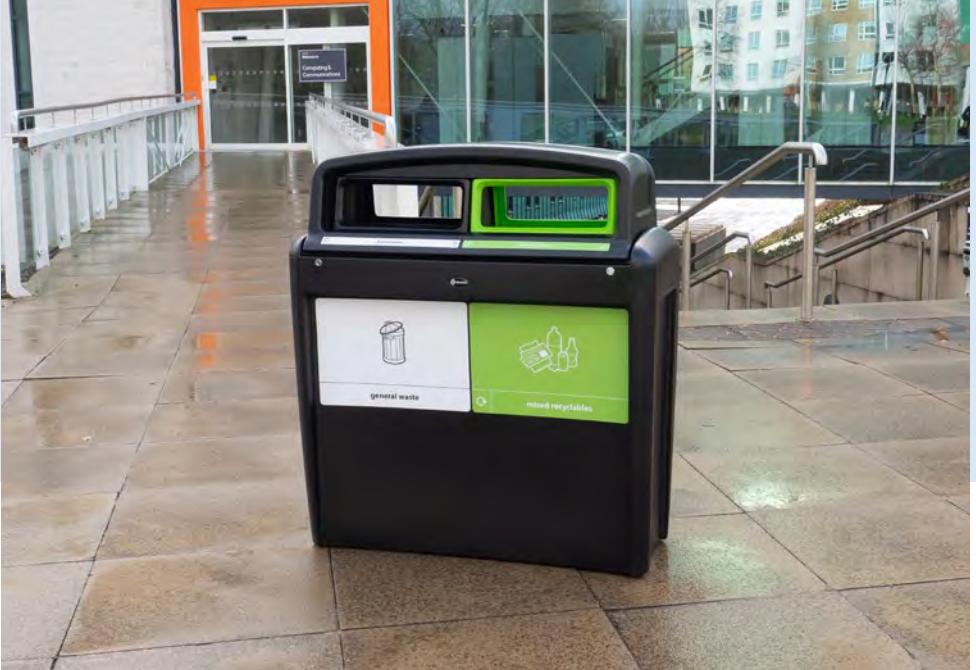
Nexus® Evolution City Duo Recycling Bin

We produce an extensive range of outdoor recycling bins of the highest quality in both traditional and contemporary designs. All of our recycling containers are designed to be hard-wearing and long-lasting and feature easily identifiable graphics to make recycling easy.