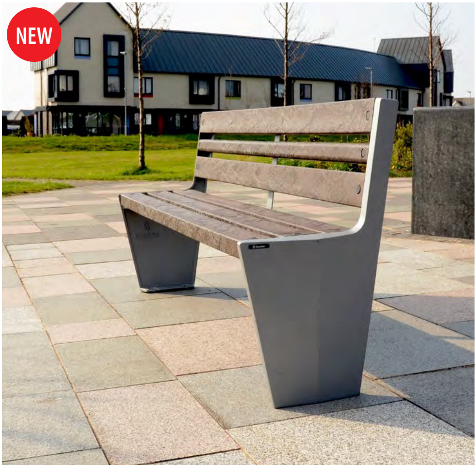
NEW Vistra™ Seat