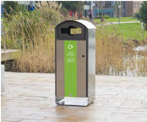
Electra™ Curve 85 Recycling Bin