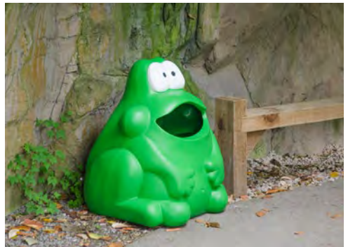
Froggo™ Litter Bin