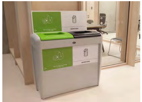
Nexus® Evolution Duo Recycling Bin