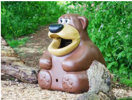
TidyBear™ Litter Bin