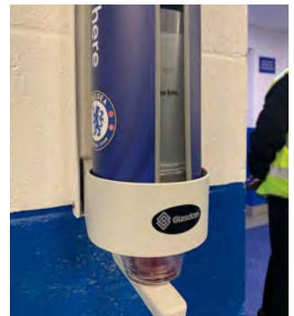
Nexus® Cup Stacker