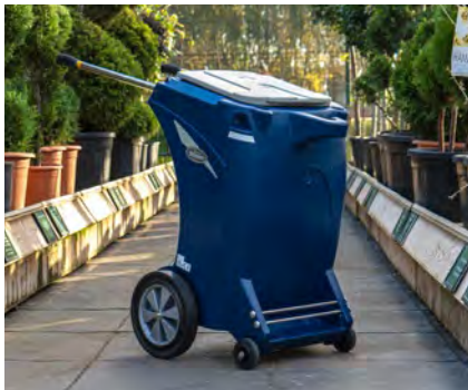
Skipper™ Multi-Purpose Cleaning Trolley