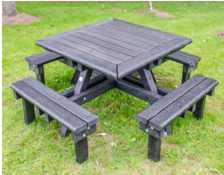
Pembridge™ Picnic Table