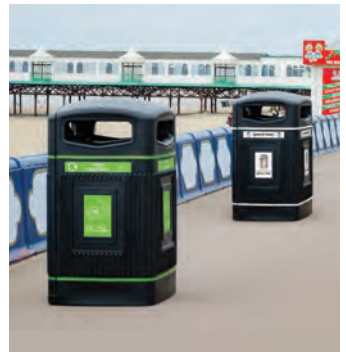
Glasdon Jubilee™ 240 Wheelie Bin Housing