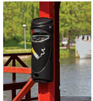
Ashmount SG™ Cigarette Bin