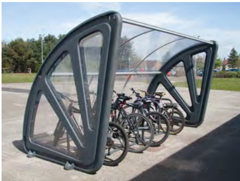
Aero™ Cycle Shelter