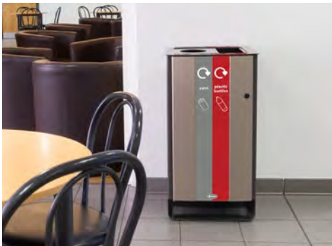
Electra™ 85 Duo Recycling Bin