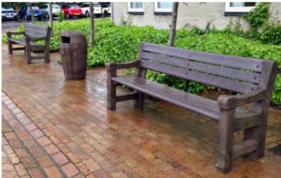
Elwood™ Seat and Sherwood™ Hooded Litter Bin