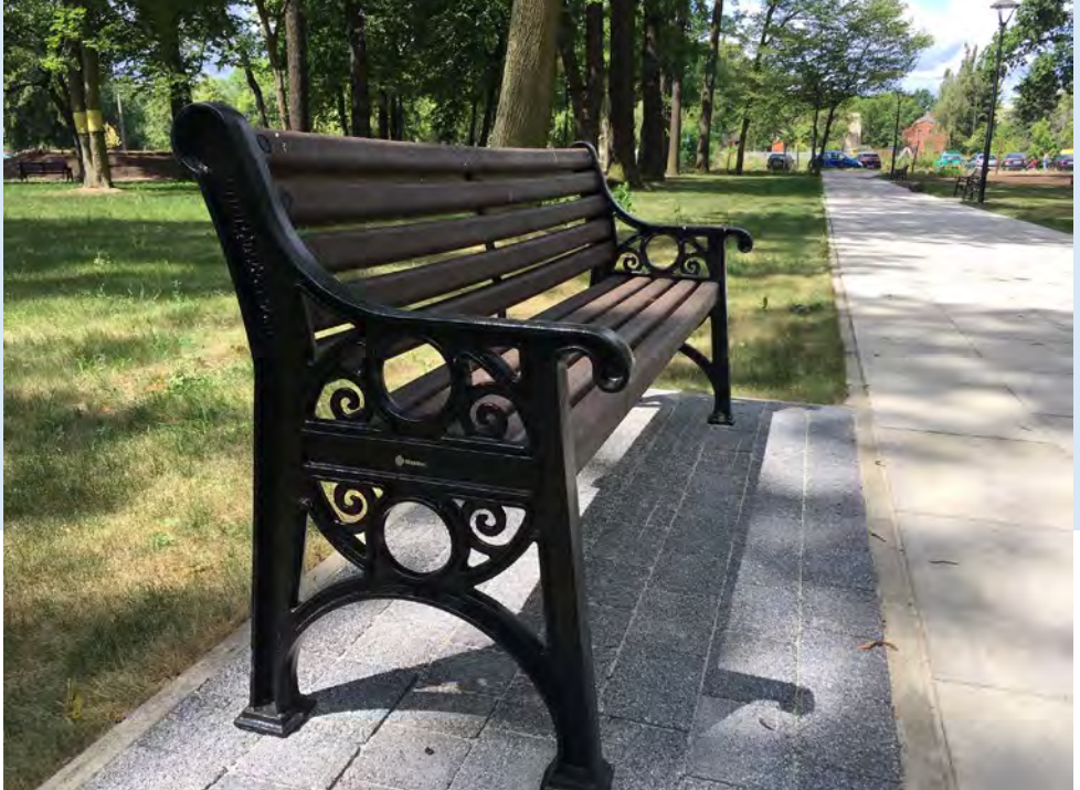
Lowther™ Seat with Brown Enviropol Slats

Glasdon offer a range of traditional and contemporary styled seats and benches to enhance seating areas, both indoors and outdoors. Our seats and benches are low-maintenance, weather- and vandal-resistant and manufactured from high-quality materials for a long service life.