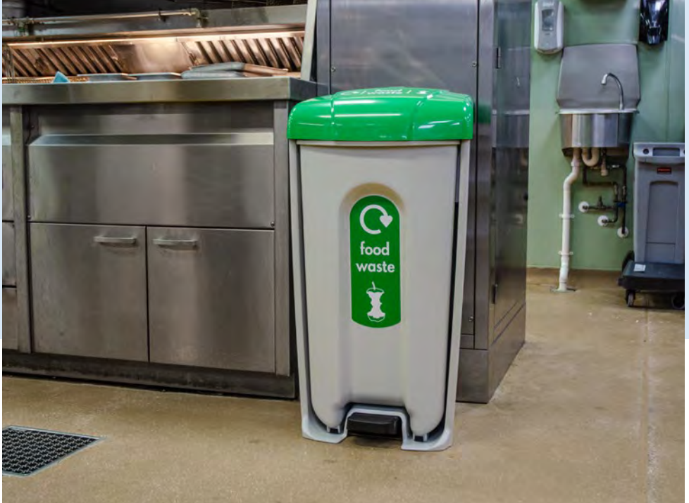
Nexus® Shuttle Food Waste Bin

Our food waste recycling bins are ideal for kitchens, canteens, food courts and any other areas where food is prepared or consumed. The easy to use foot pedals and large apertures make food waste disposal effortless and hygienic.