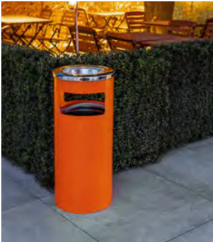
Tweed™ Litter Bin