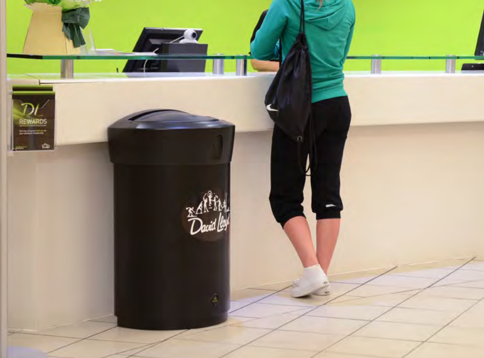
Envoy™ Litter Bin

We produce an extensive range of indoor litter bins made from highly durable materials to ensure a functional and long service life. Our collection of contemporary internal litter bins are stylish and will complement their surroundings.