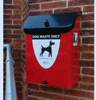
Metal Fido 35™ Dog Waste Bin