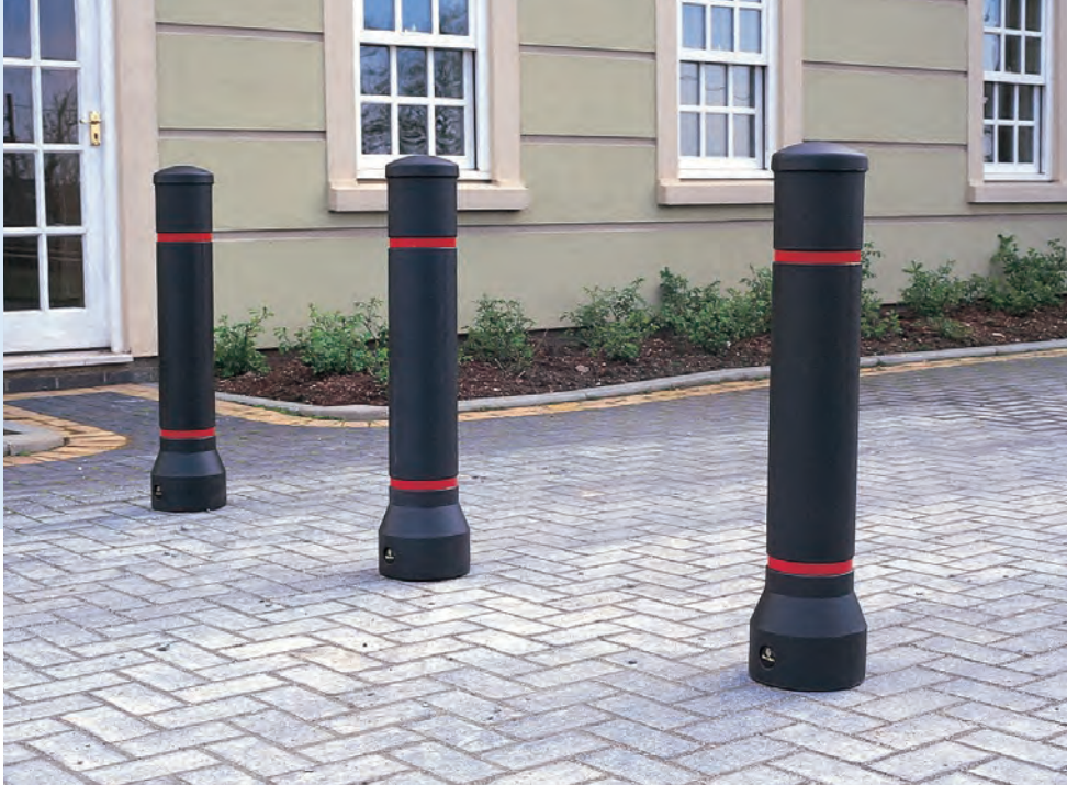
Neopolitan™ 20 Bollard

Our Bollards and Posts are available in a variety of traditional or modern styles and can be used for access control, verge protection and delineators to identify parking restrictions.