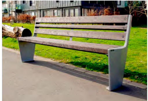
NEW Vistra™ Seat