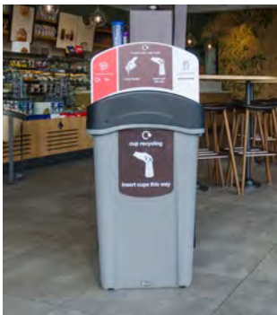
Eco Nexus® Cup Recycling Station