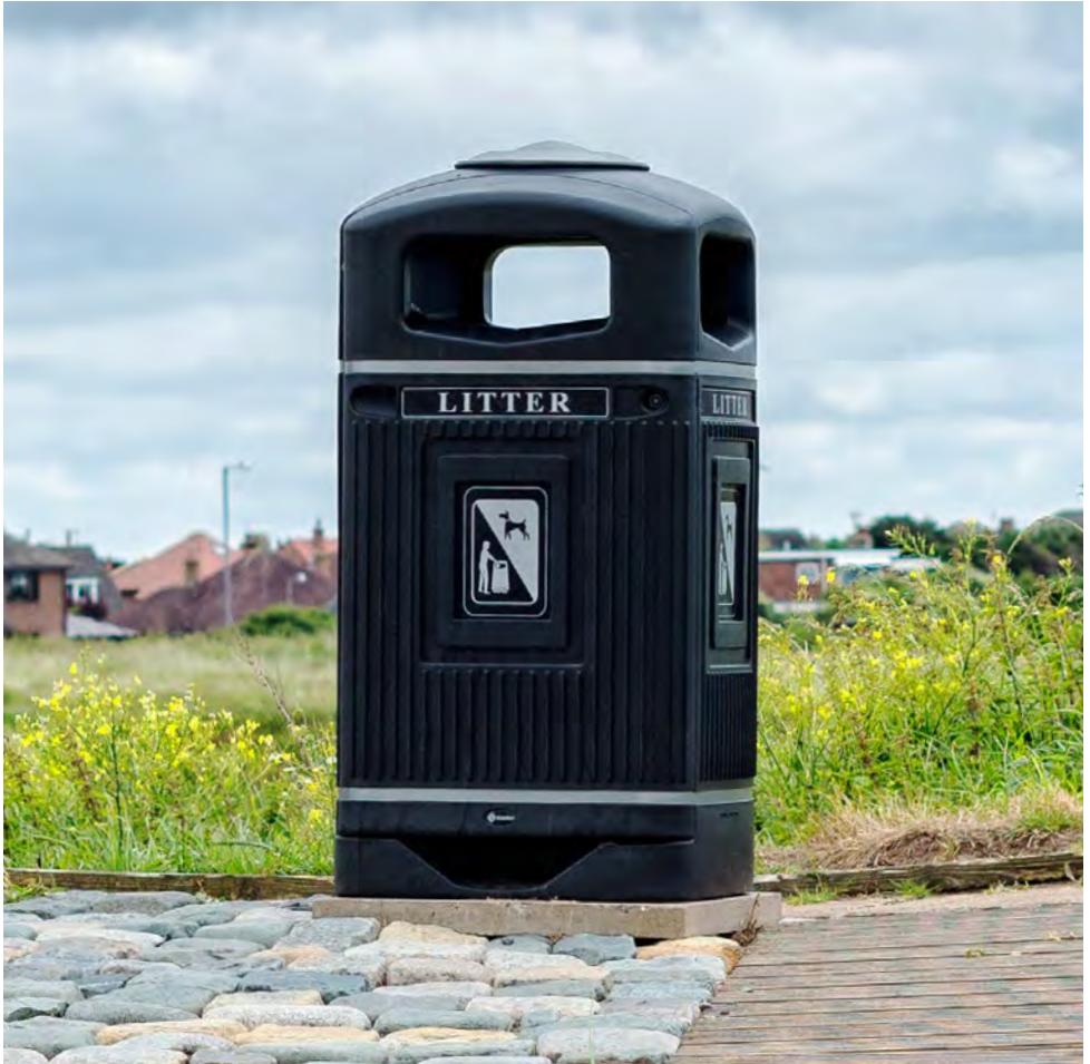
Glasdon Jubilee™ 110 Litter Bin