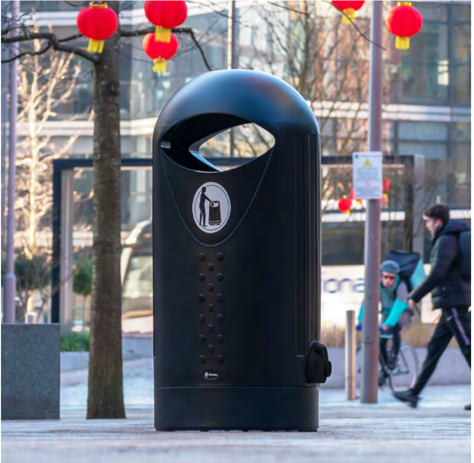
Elipsa™ Litter Bin