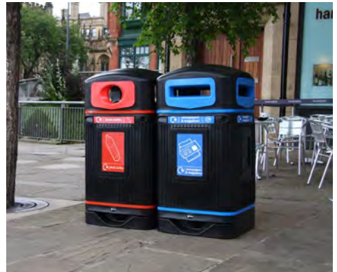
Glasdon Jubilee™ 110 Recycling Bin