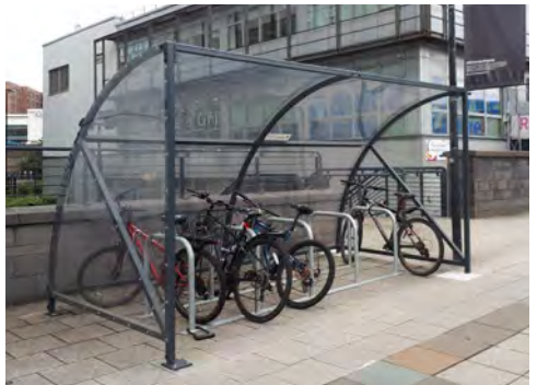
Echelon™ Cycle Shelter with Cycle Toast Rack