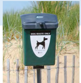
Fido 25™ Dog Waste Bin