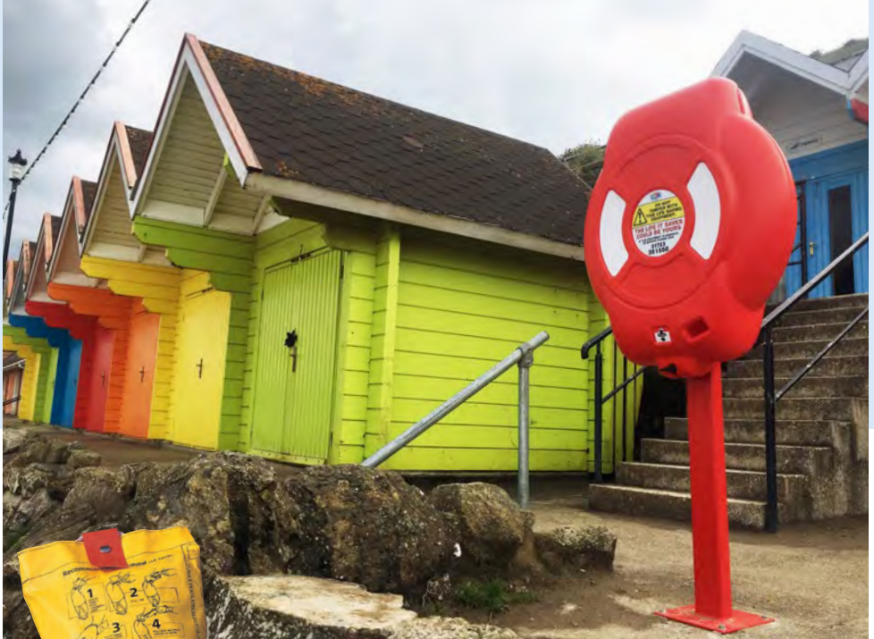
Guardian™ Lifebuoy Housing

Glasdon is a market leader in the manufacture and supply of life-saving water safety equipment. The range includes 24" and 30" lifebuoys with 30m and 50m throwing ropes, lifebuoy housing units, the B-Line™ throw line rescue buoy, and equipment storage units.