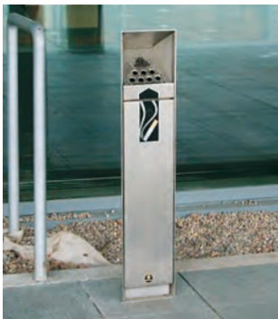
Ashguard™ Cigarette Bin