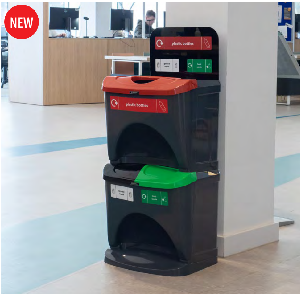
NEW Nexus® Stack Recycling Bins