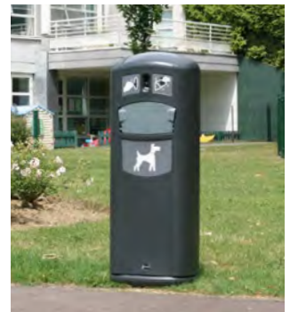
Retriever City™ Dog Waste Bin