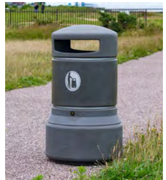
Plaza™ Litter Bin