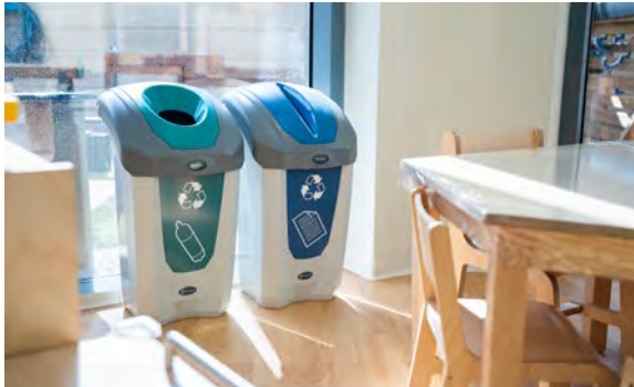
Nexus® 30 Recycling Bin