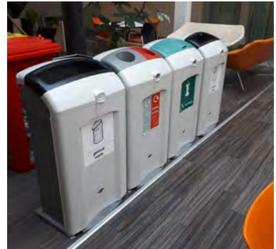
Nexus® 100 Recycling Bin