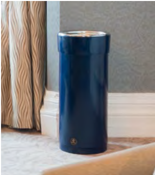
Senior Ambassador™ Litter Bin