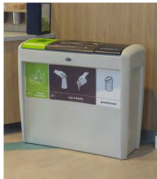
Nexus® Evolution Cup Recycling Station