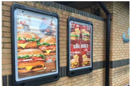
Advocate™ Poster Display Sign