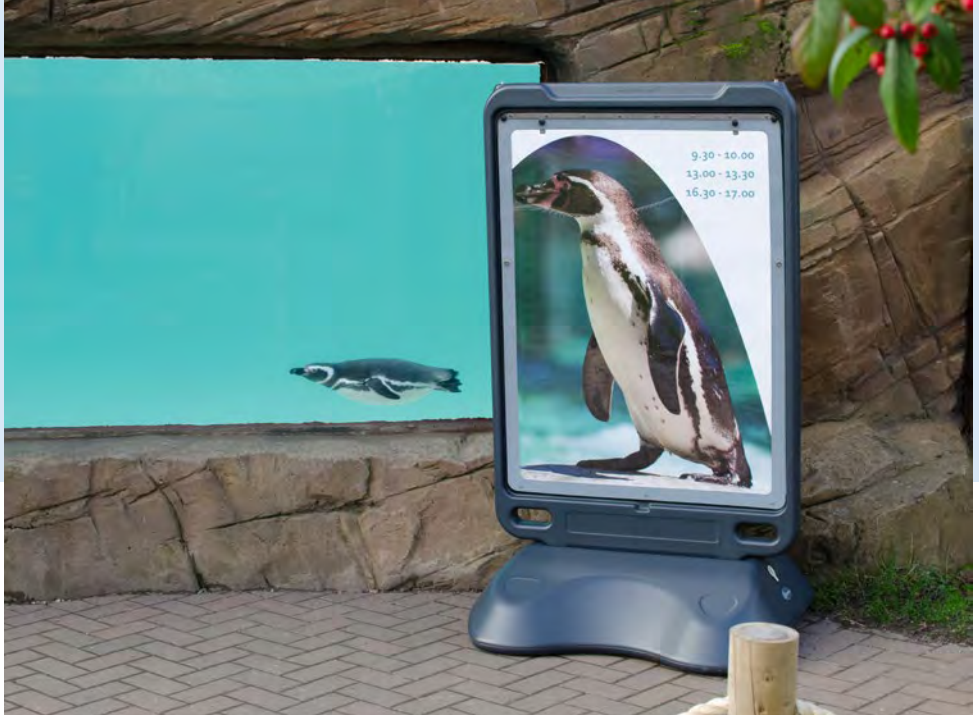
Advocate™ Poster Display Sign

Great for leisure facilities, these site sign carriers are the ideal way to promote your brand. The Everwood™ material of Glasdon Gateway will not warp or rust and the poster display sign can be easily cleaned.