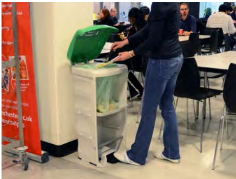
Nexus® Shuttle Food Waste Bin