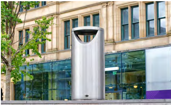
Centrum™ Litter Bin