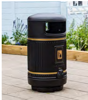
Topsy Royale™ Litter Bin