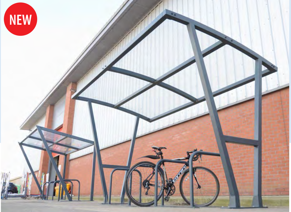
NEW Strada™ Cycle Shelter