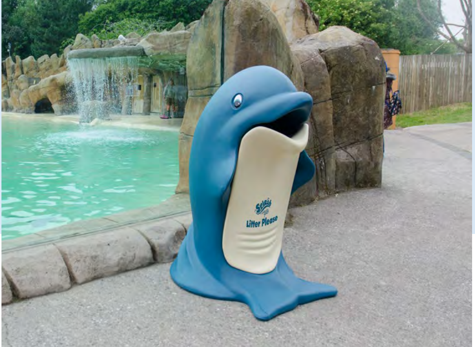
Splash™ Litter Bin

We produce a range of novelty bins, ideally suited for both indoor and outdoor spaces. The bright use of colours and interaction encourage and educate children about the importance of collecting waste.