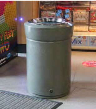
Statesman™ Litter Bin