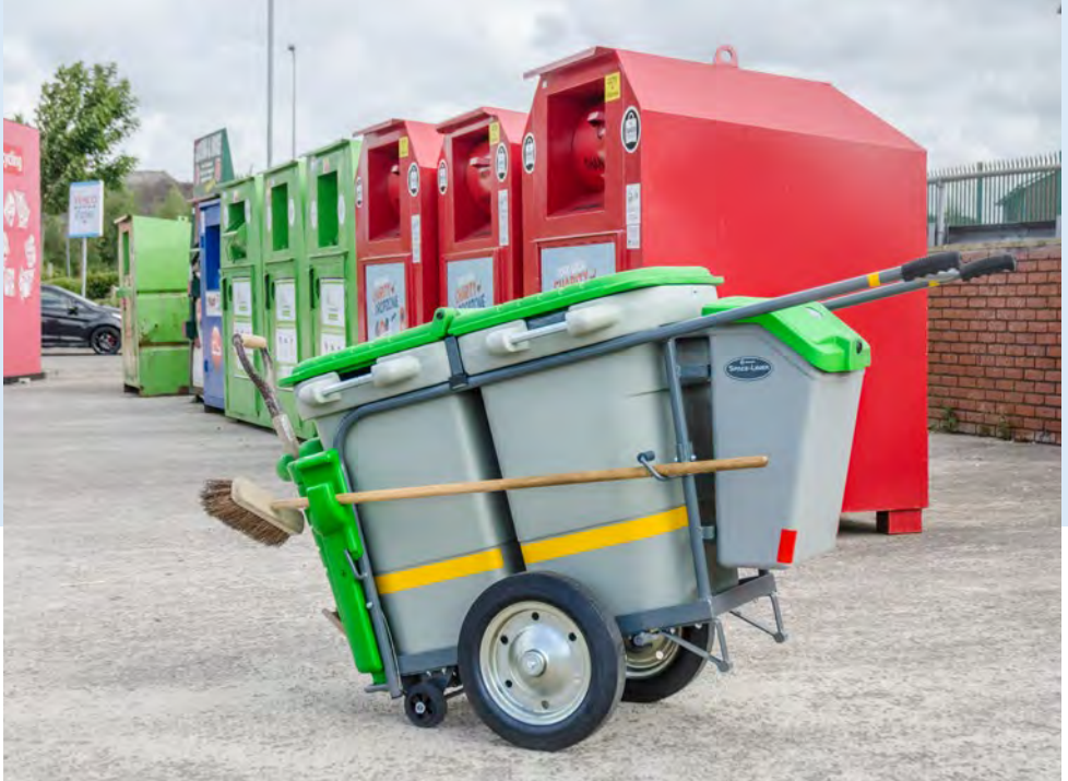
Space-Liner™ Orderly Barrow (Double Model)

Collect, segregate and transport waste quickly and efficiently with multi-purpose street cleaning barrows and litter picking tools. We produce a range of litter collection tools ideal for keeping your environment litter free. Our Orderly Barrows can be used for litter collection and segregation of waste or for transporting equipment.