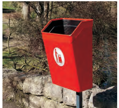
Trimline 25™ Litter Bin