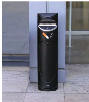
Ashguard SG™ Cigarette Bin