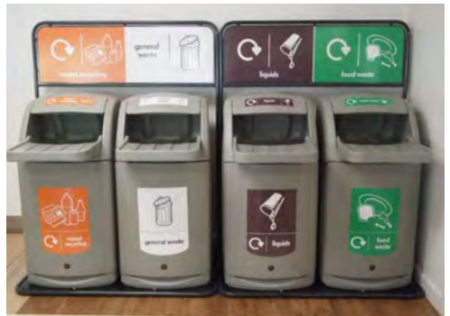
Combo™ Tray Shelf Catering Waste Bin