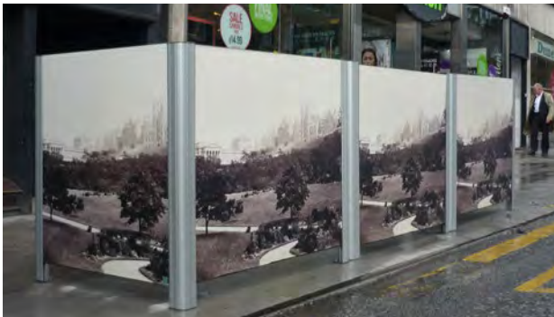
Visage™ Screen System