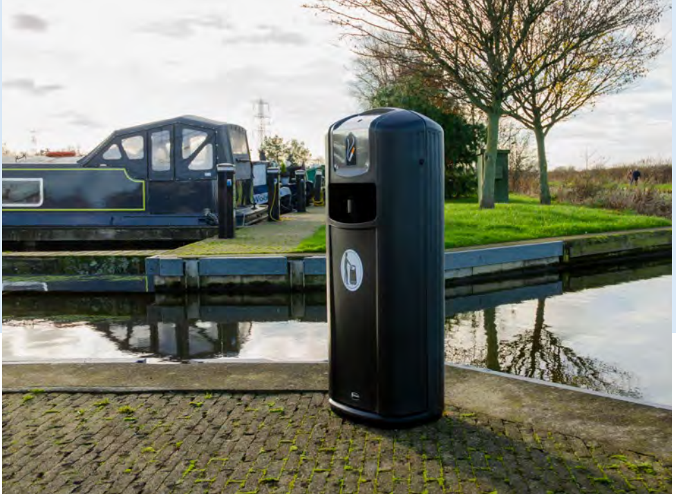
Integro City™ Cigarette & Litter Bin

We're here to help you keep cigarette waste under control on your premises with a wide range of quality, hard-wearing smoking bins. The Glasdon collection offers everything from free-standing ashtrays and cigarette bins to wall-mounted ashtrays.