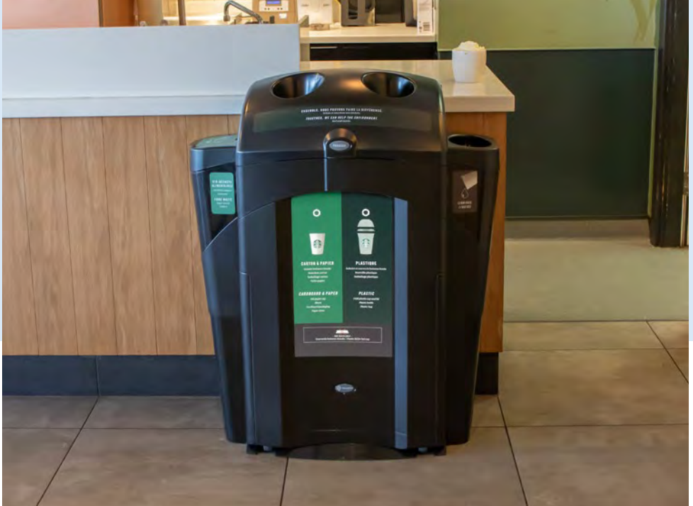
Nexus® 100 Duo Recycling Station

The Glasdon cup recycling bin range has been designed to help you implement an efficient cup recycling programme and increase your cup recycling rates. Choose from our selection of specifically designed cup bins and cup recycling stations which feature liquid reservoirs and separate compartments for cups and lids.