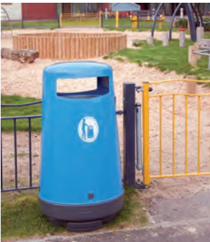
Topsy 2000™ Litter Bin